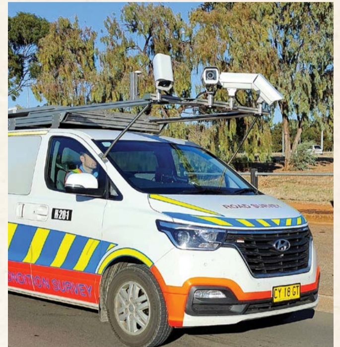
Vehicles equipped with cameras and 3D lasers are used to assess the condition of Council's roads.

three-dimensional lasers that collect data and imagery for Council roads, kerbs, signs and local traffic management devices. The vehicles travel through the area at normal traffic speeds, recording defects within the pavement like cracking, potholes, surface defects, roughness and rutting. These attributes are used