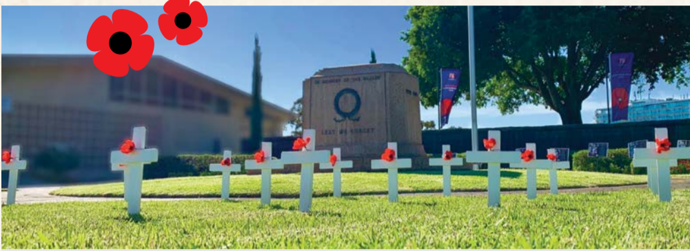
Remembering the 54 members of the Walkerville and Gilberton communities who fell in WWI.