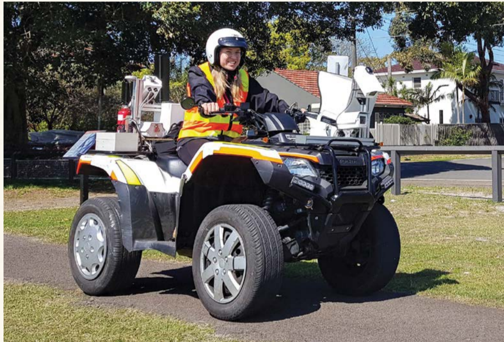
All Terrain Vehicles (ATVs) are being used to assess Council's footpaths.

IMG certified pavement field technicians conduct a visual inspection every 20m and provide scores between 1-5: 1 being in new or excellent condition and 5 being in poor condition, which has a defect that relates to a hazard.