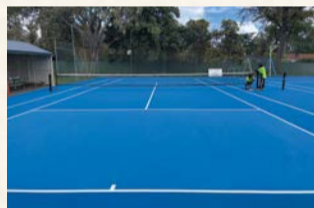
Willow Bend courts before and after resurfacing works.