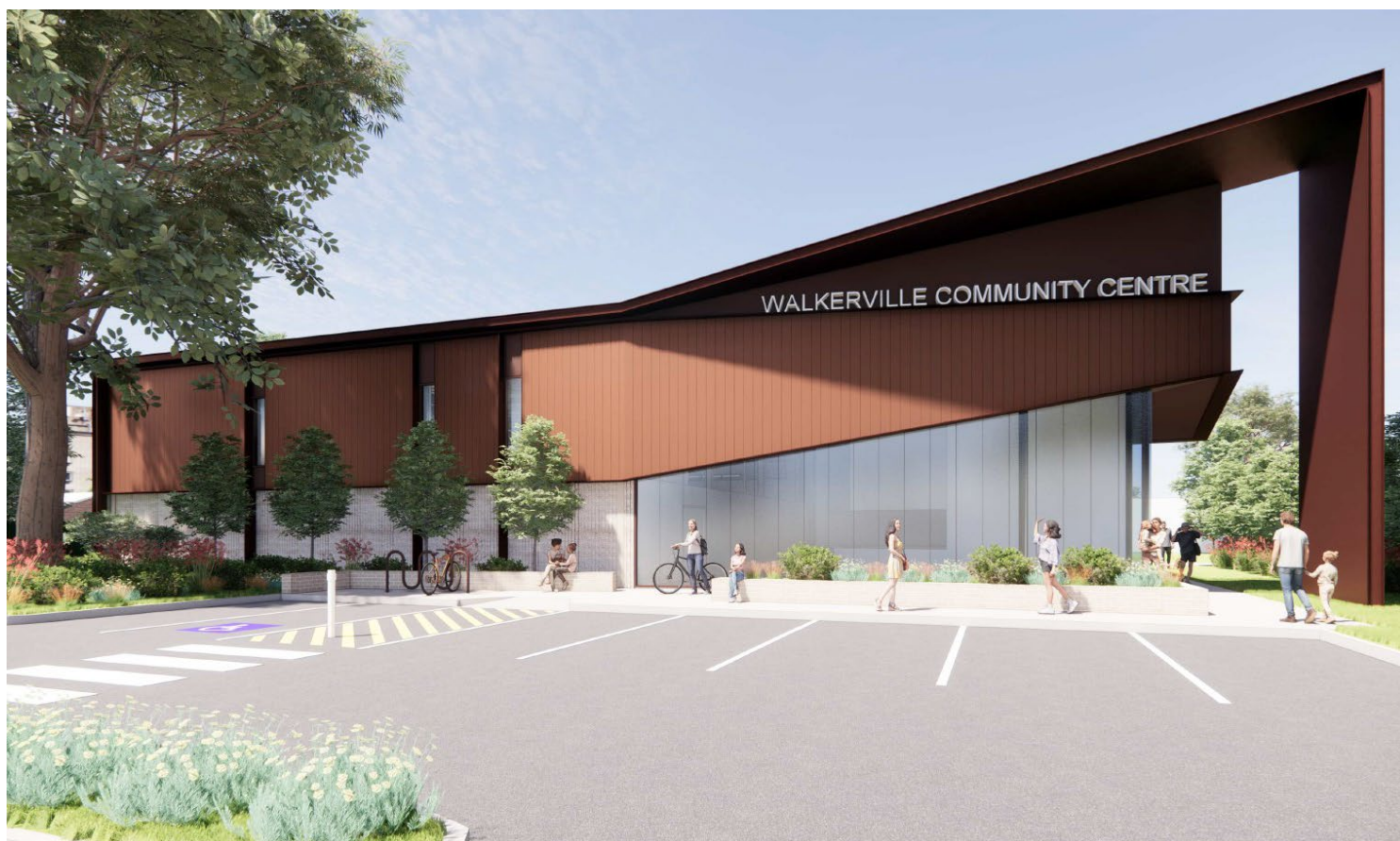
The first initial concept design of the 39 Smith Street refurbishment.

An expressions of interest process for users of the refurbished facility is also expected to take place later in the year.