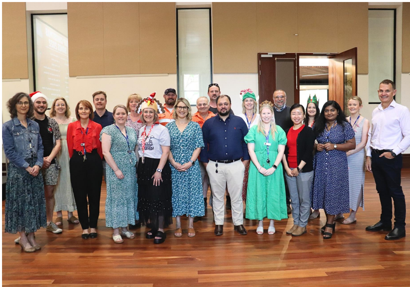
Town of Walkerville Administration staff.

Town of Walkerville wants to wish the community a happy New Year and hopes that 2024 brings all residents and ratepayers good health, happiness and success.