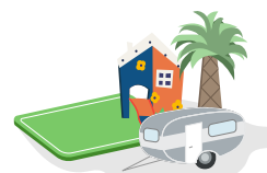
Levi Oval, Caravan Park and Playground 1A Harris Road, Vale Park