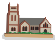
St Andrew's Anglican Church 43 Church Terrace, Walkerville