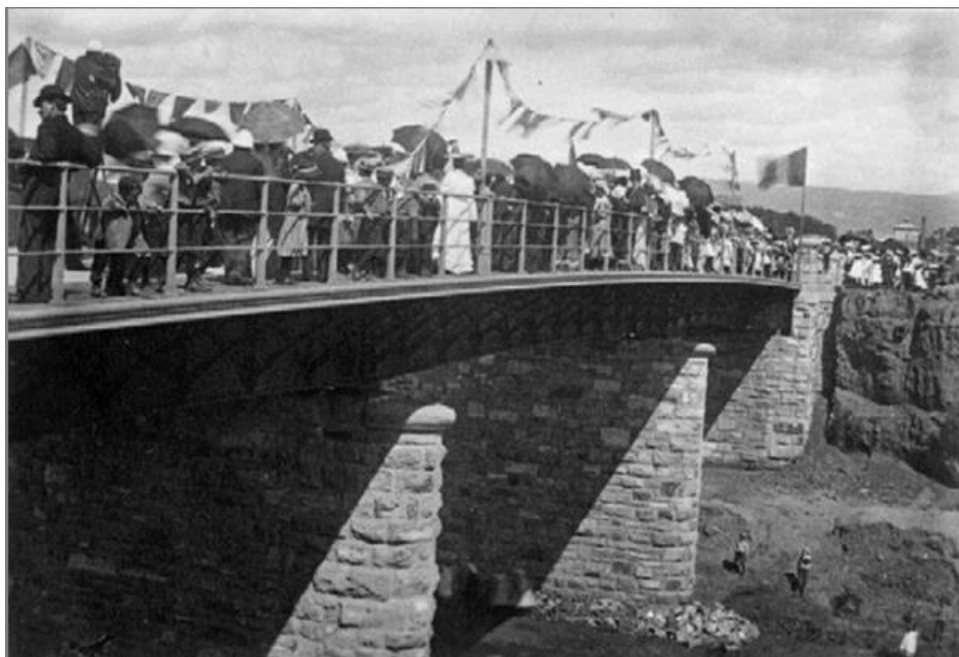
People flooded to the opening of the Tennyson Bridge in 1903.

It was the first time the Governor had visited the district and there were, of course, many speeches by several dignitaries.