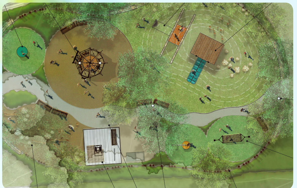
Detail of Concept plan

9.30am – 11.30am, Saturday 29 September Mary P Harris Reserve (opps. Walkerville Woolworths shopping centre).