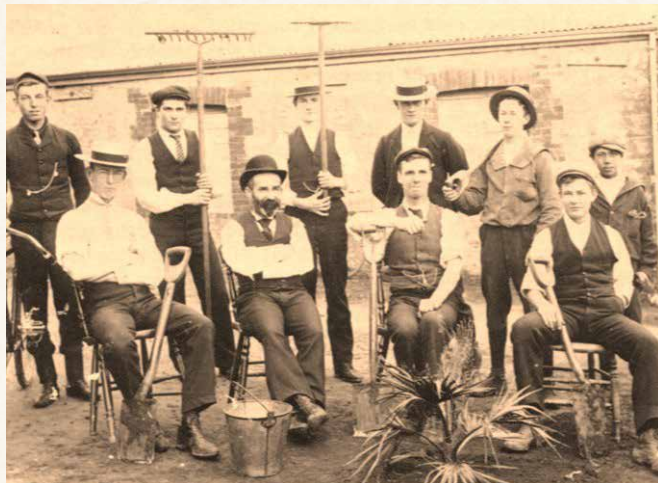
Community working bee

In 1838, 100 pioneers and investors acquired one-acre lots in Walkerville to start a new life in a new colony. Streets were surveyed and land advertised for between £25 and £50. Before too long the village of