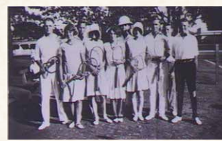
Walkerville Tennis Club circa 1924

Walkerville Shopping Centre, Walkerville Terrace Walkerville.